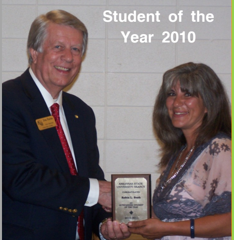
Student of the Year 2010