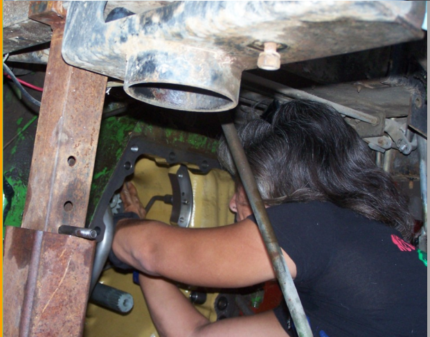
Robin is a CNA on the weekends, but by weekday she is repairing seals on hydraulic pumps