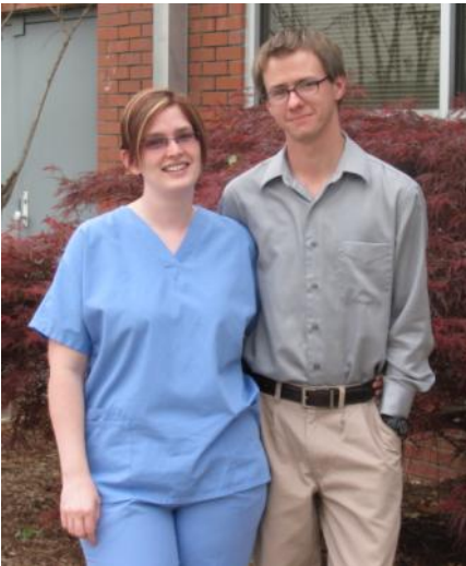
April 2011: Ready for success!